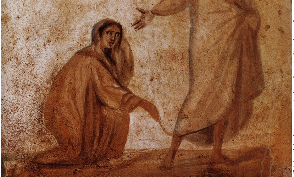
Christ heals the bleeding woman, as depicted in the Catacombs of Marcellinus and Peter.